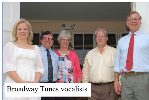
Broadway Tunes vocalists