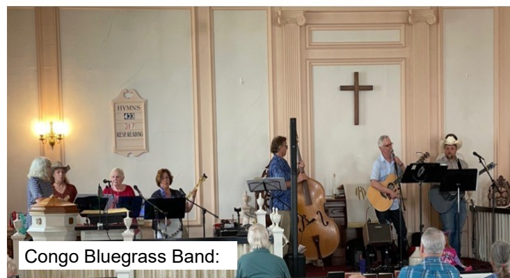
Congo Bluegrass Band: