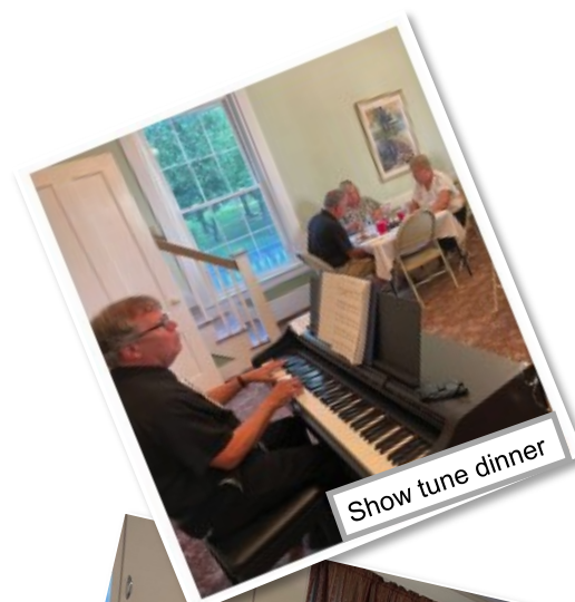
Show tune dinner