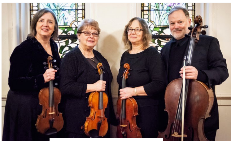
Artful Noise String Quartet

https://www.fccmeredith.com/past-events.html .