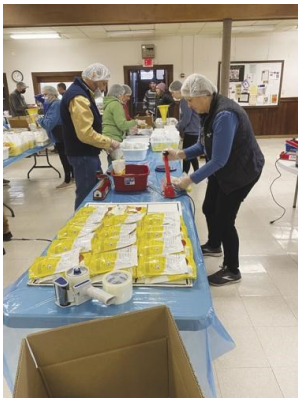
Packaging 10,000 meals of mac and cheese

The Missions Board would like to thank everyone who has supported our missions throughout 2022. We were able to participate in many, many projects this year and we are looking forward to a great 2023.