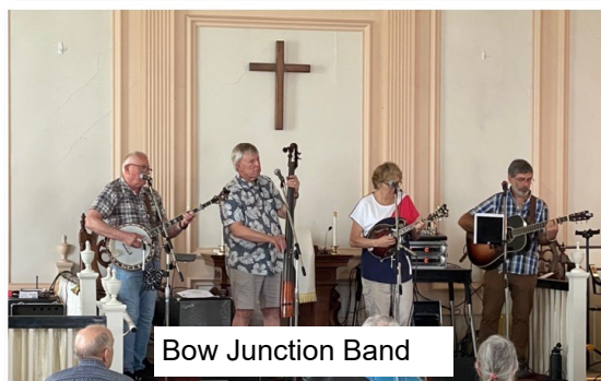
Bow Junction Band

The Joyful Noise 2022 Music series kicked off on Saturday, May 28 th with a Bluegrass & Americana Music concert. Although scheduled to be held outdoors at Hesky Park on Memorial Day weekend, mother nature had other plans for it to rain that day, so the concert was moved into the sanctuary. Three different bands performed that afternoon to the delight of those in attendance. Bow Junction sold a few CDs at the concert and donated the proceeds to FCC's Joyful Noise music program. ∴